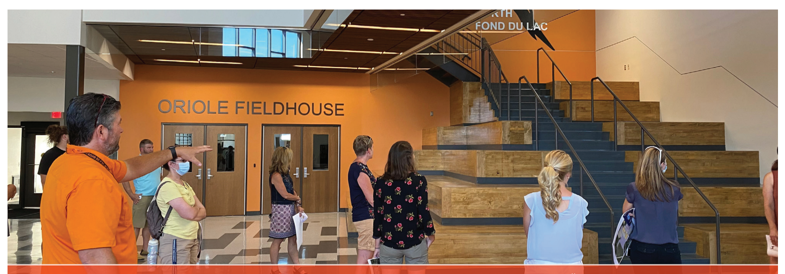
Staff Touring Friendship Learning Center in North Fond du Lac and Discovering the Benefits of a "Learning Stair"

Demolishing the District-Purchased House on High Street