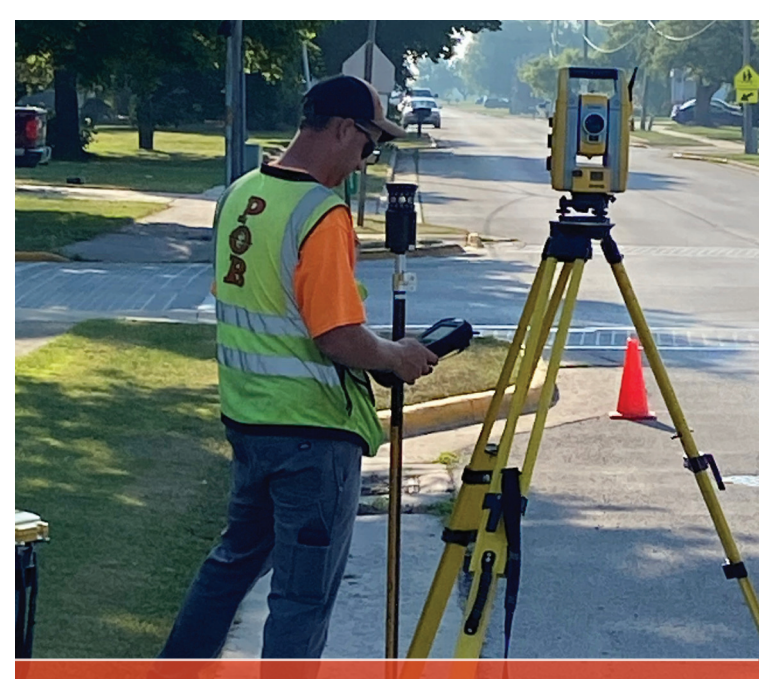
Point of Beginning Conducting Site Survey Work