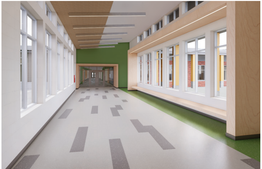
Interior Design Finishes of Elementary School Entrance Corridor