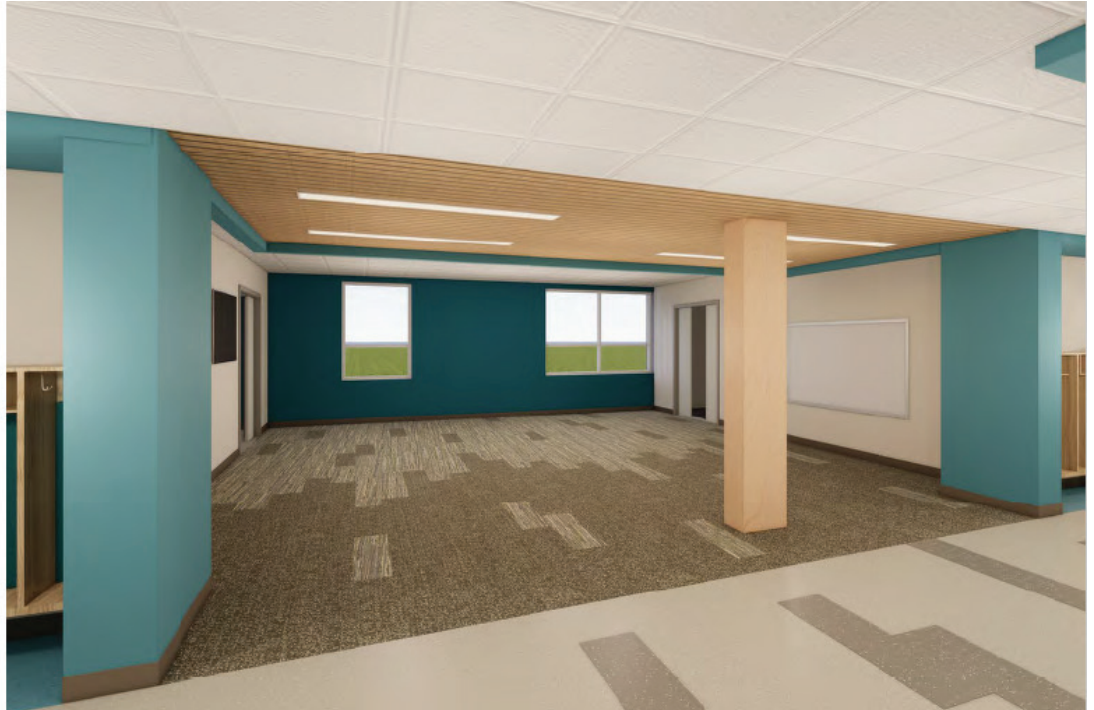
Interior Design Finishes of Elementary School Resource Space